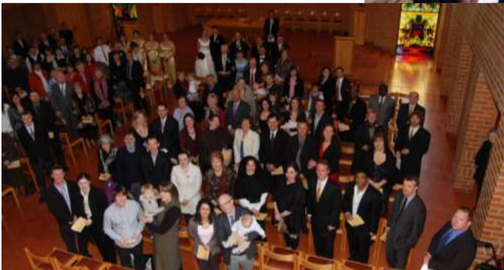
Most of the congregation at the wedding