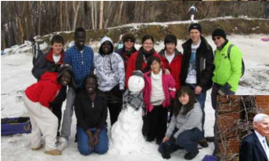
Knox Youth Group at the snow