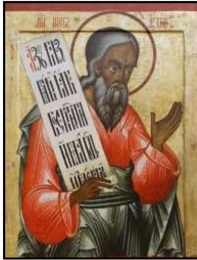
Picture of Haggai

might return. Alas they had not. However things were now going to change (18-19). Mark this date – '18 th December 520 BC!' This will be a red letter day. 'From this day on I will bless you.' (19). From this day on the Lord's blessing will be evident in the fruitfulness of the vine, the fig, the pomegranate and the olive tree. Conditions were now in place to receive God's blessing. How does this apply to us today in May 2010?